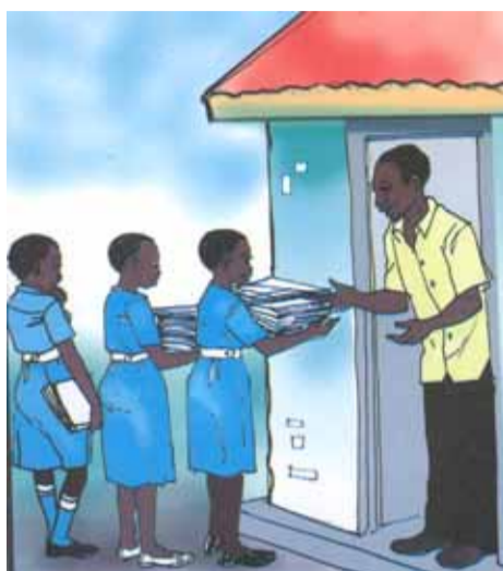
Safety friends: never go alone. Go and return with friends

Make it more than NO. Say: "No thank you. That will destroy my future." "I cannot." "What you want is against the school rules." "Please keep away from me." "Please stop. I don't like that." "That is not fun." "I will report you."