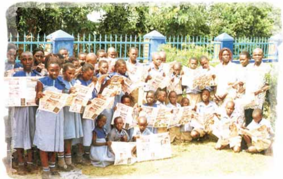
We keep our bodies and our environment clean. Pupils of Joy PS, Entebbe, Wakiso

because it is filled with blood. It is normal and healthy.