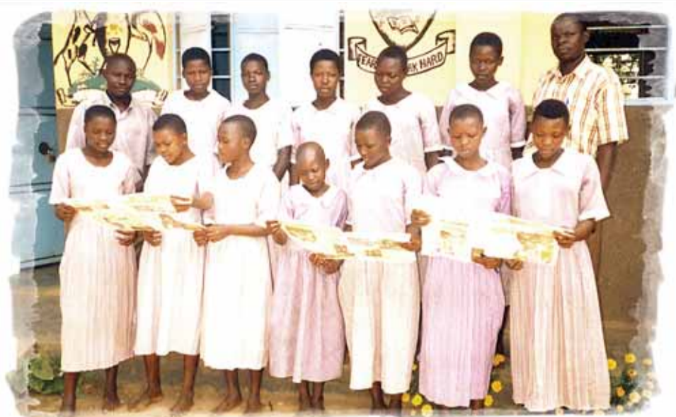
Thank you Young Talk for giving us tactics against sugar daddies

It is due to the influence of male hormones. It may happen without any obvious cause. The penis is erect