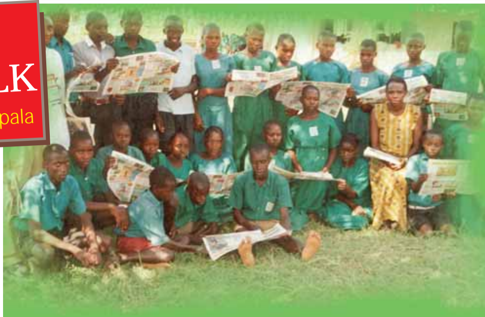
Pupils of Omungyenyi PS, Ntungamo

There are many causes. But the leading cause of failure to have children among women and men is STD infections. The infection may