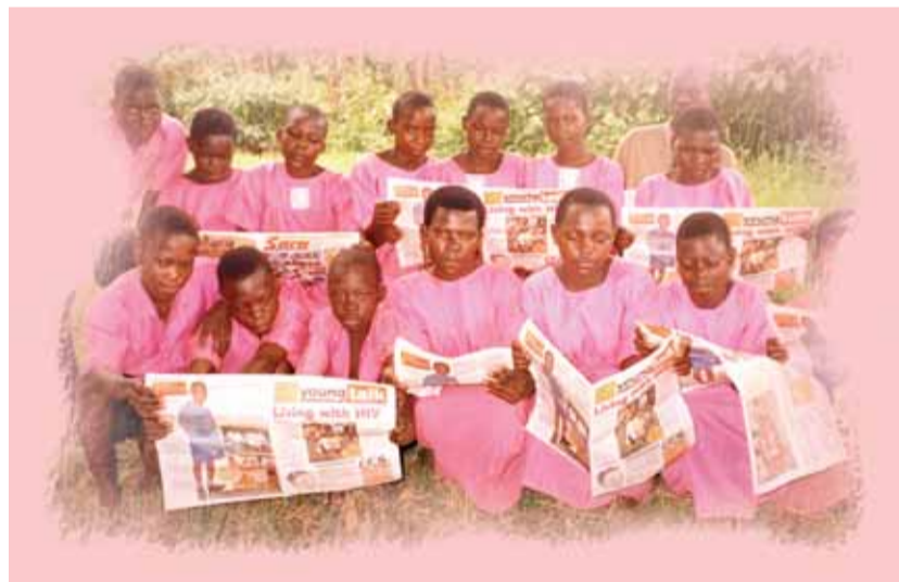
Pupils of Nakandula PS, Kiboga

cause blockage of the fallopian tubes. This may prevent pregnancy from occurring though menstruation takes place. But some women may not produce because their husbands are infertile. Both men and women can be infertile.