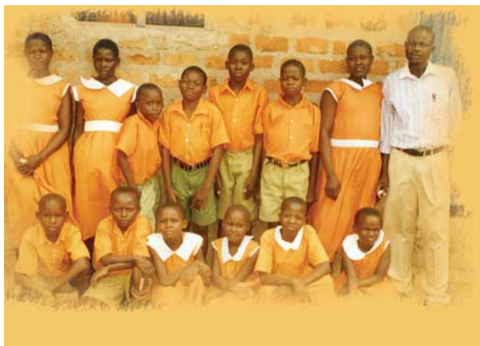
Pupils of Malaba Progressive PS, Tororo