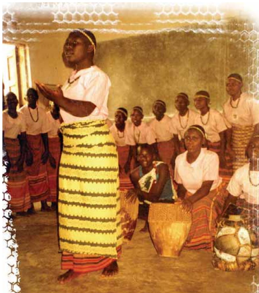
Pupils of Kisokarera PS, Kisoro singing. You can use songs and drama to educate fellow pupils about the facts and dangers of early sex.