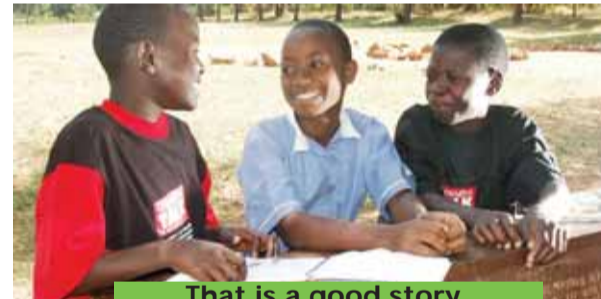
That is a good story.