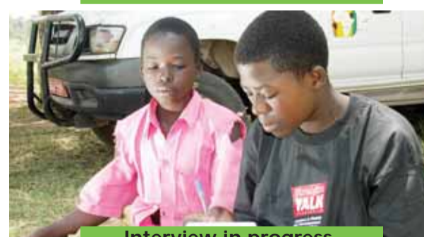
Interview in progress.