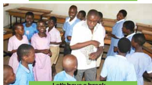
Let's have a break.