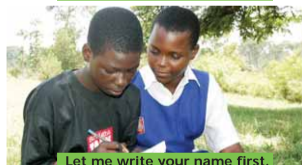
Let me write your name first.