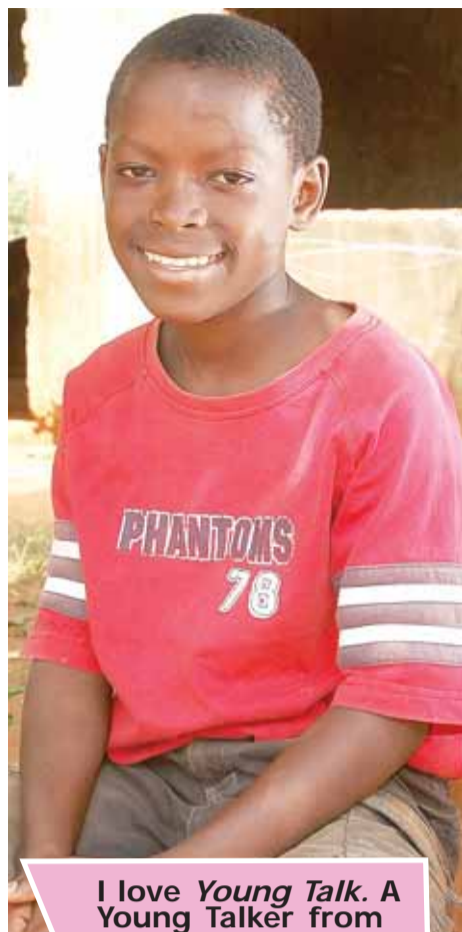
I love Young Talk. A Young Talker from Mayuge district