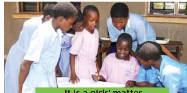
It is a girls' matter.